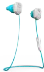
LEAP WIRELESS FOR WOMEN

BLUETOOTH COMPATIBILITY For Easy to Use Call Control