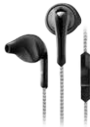
SIGNATURE SERIES IX-3000

REFLECTIVE WOVEN CORDS Tangle and Tear Resistant